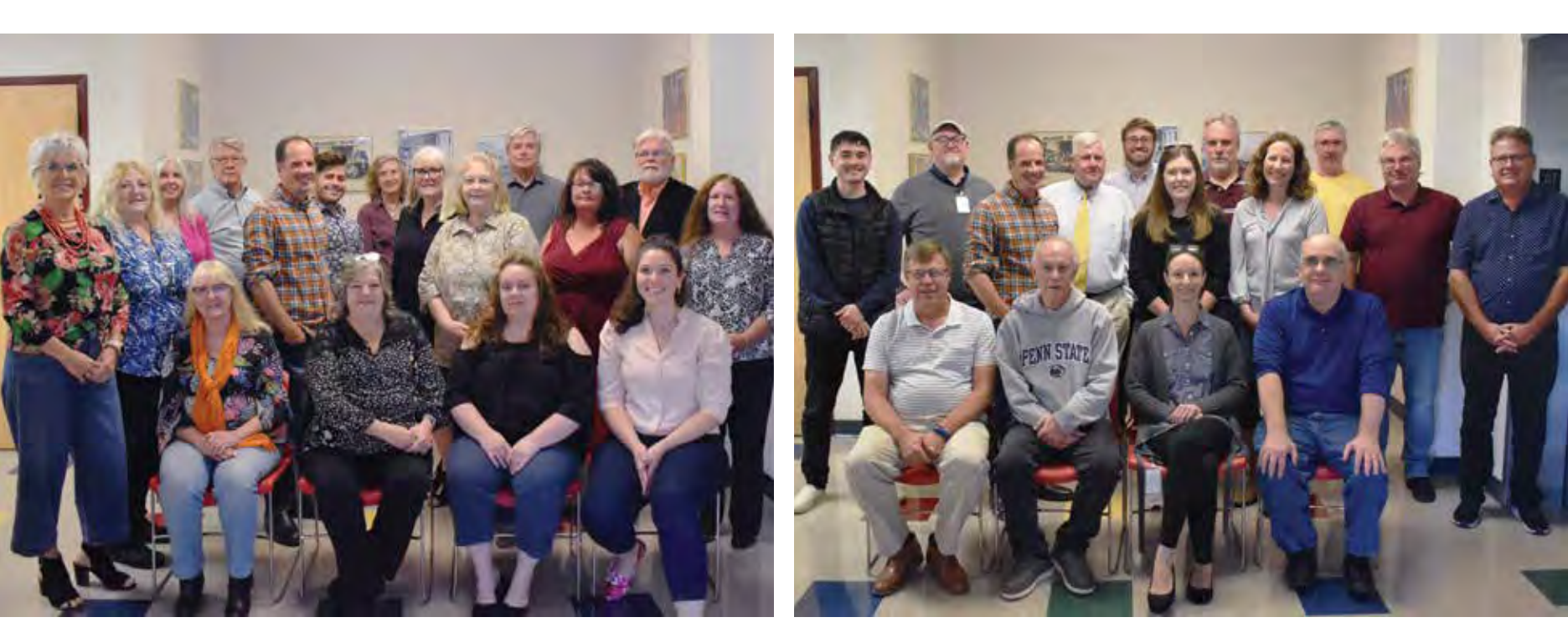
How many people do you know in these photos of the Daily State News advertising and news teams?