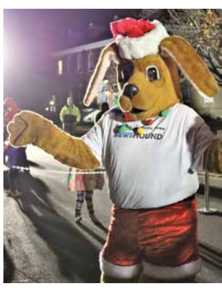
The Newshound was even dancing!