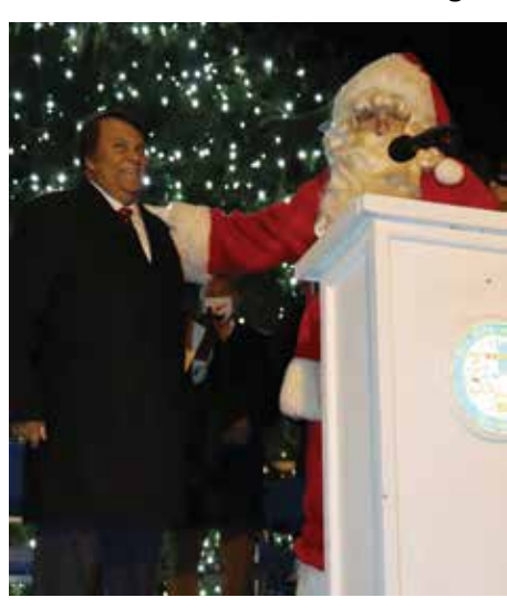
Santa made a list and checked it twice - and Mr. Mayor's been very nice!