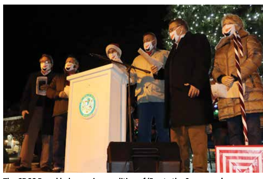
The CDCC Board led a rousing rendition of 'Frosty the Snowman.'