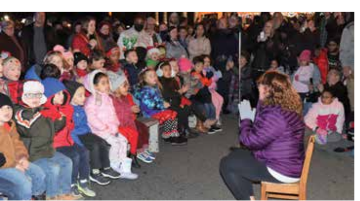
The songs of the children always add so much to the