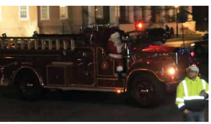
Santa arrived right on time!