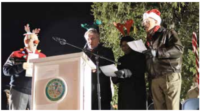
Caroling by local dignitaries is a favorite portion of the