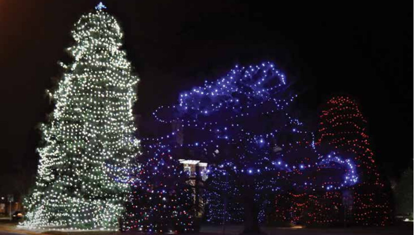
The Downtown lights are so pretty.