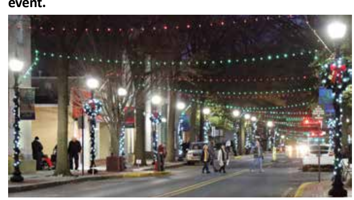
Downtown Dover loves to light it up!