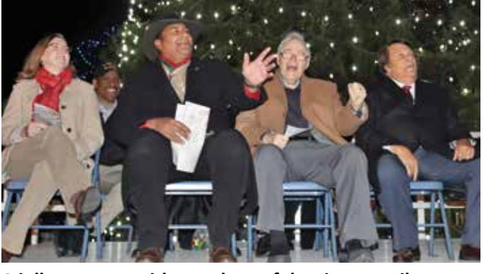
A jolly moment with members of the city council.