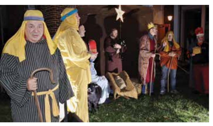
Wesley United Methodist Church provided their annual living nativity.