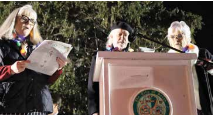
Rockin' Around the Christmas Tree with the Delaware State News!