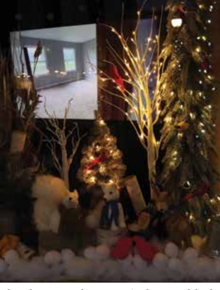
The decorated store windows added a great touch to the downtown.

And thank you, First State Manufactured Housing Association, for your generous donation to the food drive!