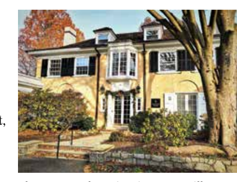
The newest location in Greenville