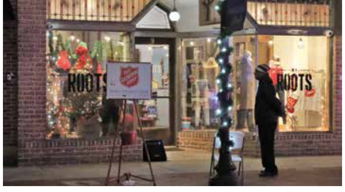
Extended shopping hours gave more time to shop – and