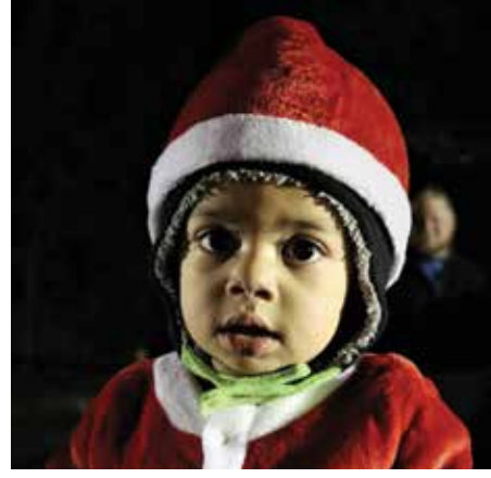
Look at those eyes!