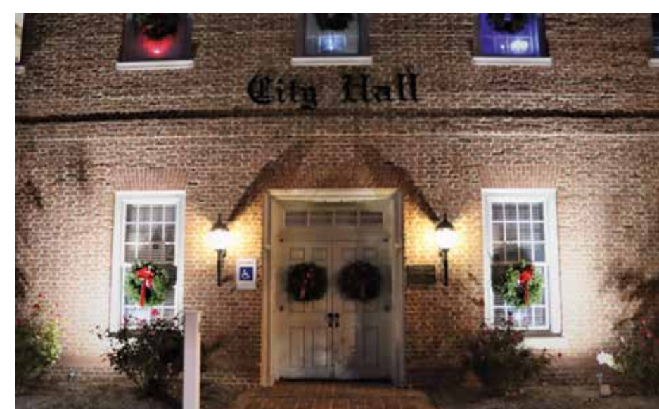
City Hall decorations are always beautiful.